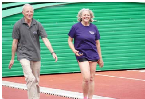
Figure 2: participants walking one-mile as fast as possible

For the 1 mile-WT, participants were instructed to perform a one-mile walk as fast as possible (Fig. 2). The time to perform the walk was included in an equation to predict \dot{V}O_{2max} taking into account individual characteristics and final heart rate (HR). The NE-BEM estimates \dot{V}O_{2max} based on a calculation including gender, age, body mass index, resting HR, and self-reported physical activity (Fig.3).