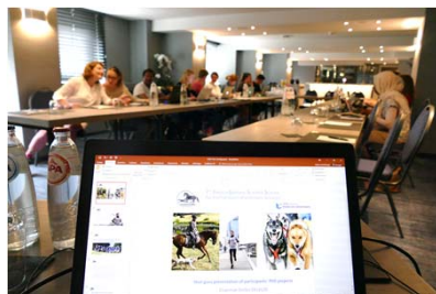
Figure 3: self-reported physical activity does not require an exercise test

For the 1 mile-WT, participants were instructed to perform a one-mile walk as fast as possible (Fig. 2). The time to perform the walk was included in an equation to predict \dot{V}O_{2max} taking into account individual characteristics and final heart rate (HR). The NE-BEM estimates \dot{V}O_{2max} based on a calculation including gender, age, body mass index, resting HR, and self-reported physical activity (Fig.3).