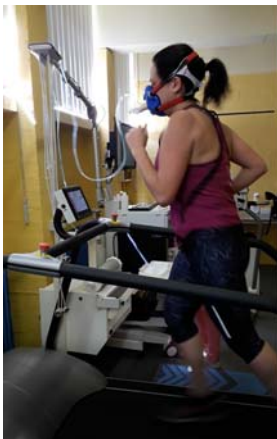
Figure 1: maximal graded exercise test on treadmill

Prior to testing, all 12 participants (men, 2; women, 10) completed a written informed consent form. They performed a maximal graded exercise test on a treadmill up to exhaustion with the expired air of the individual undergoing analysis for O_2 content using the Cosmed K4b 2 (COSMED, Rome, Italy; Fig. 1). The test began at a speed of at 7 km/h (no incline) for 5 minutes to be increased by 2 km/h every 3 minutes.