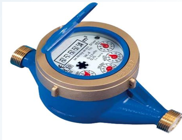
A Water Meter